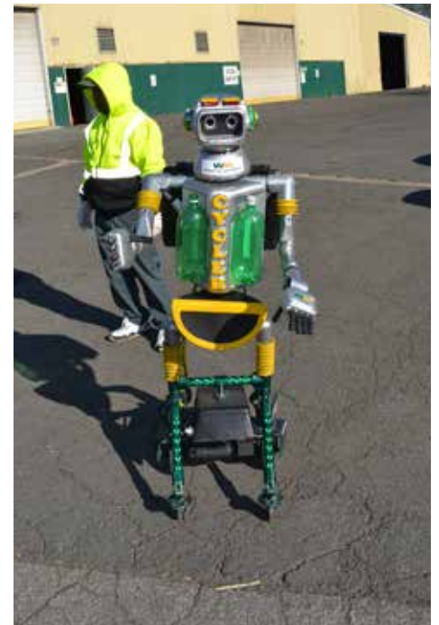
Cycler the recycle robot was on hand at RecycleFest 2014, greeting residents at the event.

Many thanks to all of the residents, Solid Waste Committee volunteers, Waste Management, Goodwill and Prime Recycling Group for making the first ever Recyclefest a success. More than 400 cars passed through the gates of the Manassas Transfer Station on Nov. 15 to part with unwanted household hazardous waste, electronic waste, shredding and used clothing. The City celebrated America Recycles Day with more recycling in one day than ever before.