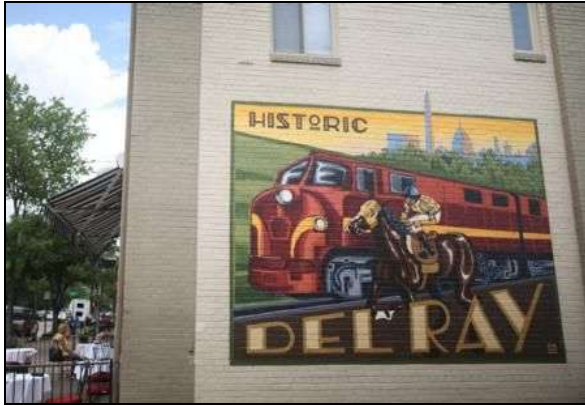
Figure 2. The scale of the mural should be appropriate to the building and the site. ( Historic Del Ray Mural, Alexandria, VA )