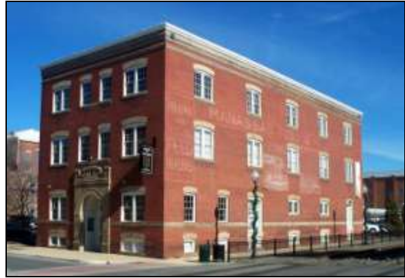
Figure 3. Faded historic murals or advertisements should not be painted over. ( Candy Factory Building, Manassas, VA )