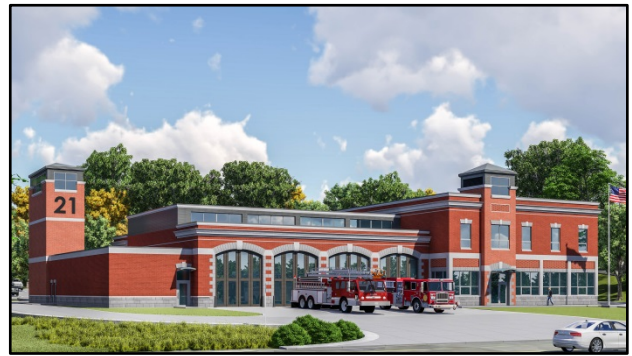
Fire & Rescue Station #21

Complete design and begin construction of a new combined fire and rescue station at 10306 Dumfries Road to provide enhanced four-minute emergency response times for the southern portion of the City.