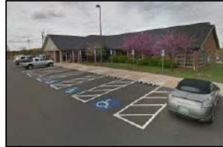
Manassas Customer Service Center

Complete design and begin renovations to the 1st and 2nd floors of City Hall (G-016), the Public Works & Utilities Facility (G-020), and the Manassas Customer Service Center (G-022).