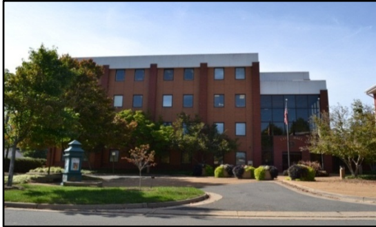
Marvin L. Gillum City Hall

Replaced the generator, which was over 25 years old and is critical to the computerized systems of the City.