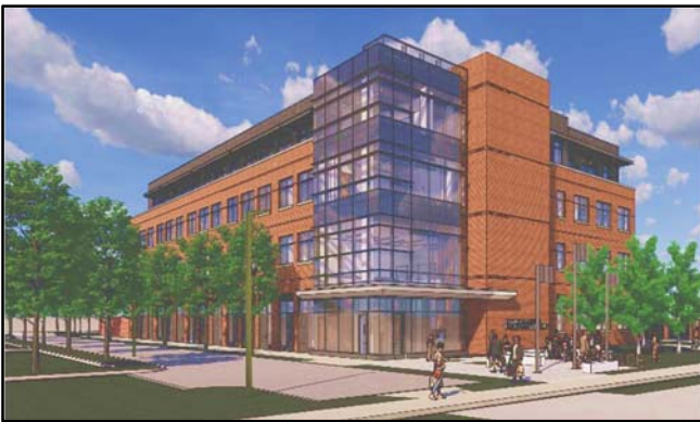
Public Safety Facility

Site and building design for the Public Safety Facility at 9608 Grant Avenue is underway. The facility will include Police Headquarters, consolidated public safety logistics, 911 Center, Emergency Operations Center, Fire & Rescue Administration, and the IT Department.