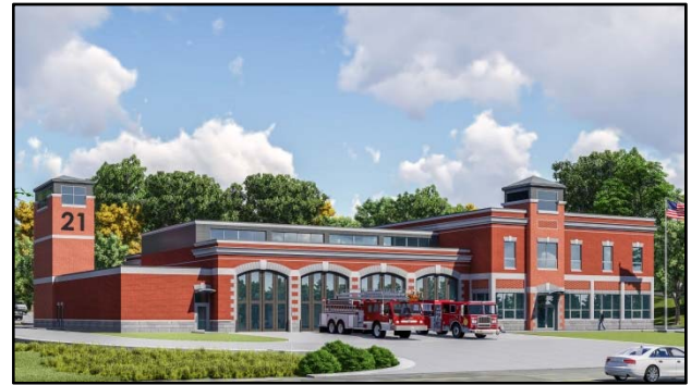
Fire & Rescue Station #21

Continue construction of the new combined fire and rescue station.