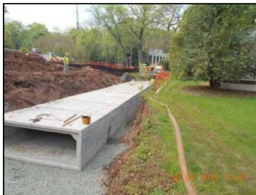
Upper Flat Branch Interceptor Project

Planning and funding continues to replace sections of gravity sewer main along the Upper Flat Branch Interceptor.